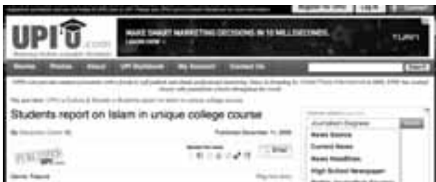
Figure 2. A screen shot of an article on the course “Reporting on Islam” published on the wire service.

Taken together, the comments reveal that the course was meaningful for him: It “definitely made me uncomfortable at times, but honestly, that is how I know it was worthwhile ... It helped me experience a part of the world and this country that I never had before.”