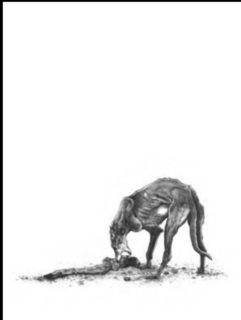
Consuming the Lack 22" x 30", Lithograph, 2012

Set near the bottom of a large, clean, thick white paper, an indecipherable breed of dog stands with an absent leg and open mouth displaying the moment before the dog begins to consume a deer appendage. With no reference to any other portion of the stag, Consuming the Lack , constructs