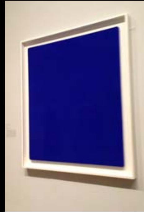
An image of Yves Klein's blue void

the world is thus on the far side of an unsilvered mirror, there is an imaginary beyond, a beyond pure and insubstantial, and that is the dwelling place of Bachelard's beautiful phrase: 'First there is nothing, then there is a depth of nothingness, then a profundity of blue [the boundless Void]' ●