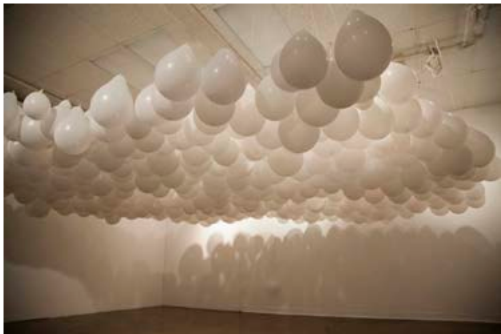
14,400 Breaths or A Day of Rest Dimensions variable Latex, breath

In 14,400 Breaths or a Day of Rest the artist inflated over 900 white balloons and hung them at mouths height from the ceiling. The number in the title roughly correlates to the amount of breaths one would take on a day of rest, i.e. a 24 hour resting heart rate. In addition to the previous motifs of water and fat, Klemens adds another element into her visual lexicon: air. Like Cover , Klemens' work evokes the philosophical Greek concept of pneuma , (the root of course we are familiar with, for it forms the base of the word "pneumatic") or wind, which in the Septuagint, the Greek translation of the Hebrew Bible, and the Greek New Testament is oft translated as soul or spirit. Like the departed spirit of Cover the artist's pneuma , her wind, quite literally, leaves her body in the making. Perhaps in one potentiality, one breath of respite is transported symbolically beneath the sheets of Cover , completing a conceptual loop. Herein lies the profound power of Klemens' program—the viewer is given metaphorical breathing room to reconcile disparate conceptual dilemmas into a meaningful diagram of human mortality. The artist gives the viewer the basic components, for now, water, fat and air, which may exist simultaneously as particle or wave, or in infinite combinations. ●