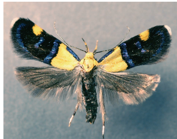
FIG. 3. O. bractella female from Port Coquitlam, British Columbia.