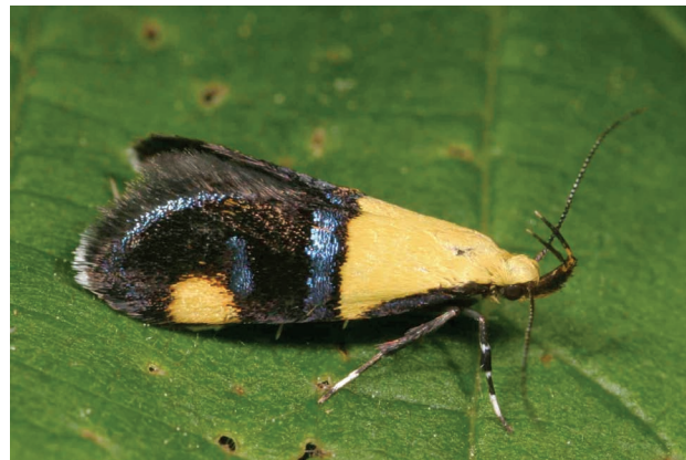
FIG. 2. Live O. bractella female from Bellingham, Washington.

The establishment of breeding populations of O. bractella in North America has been confirmed at two locations (Bellingham, Washington, and Burnaby, British Columbia), where immatures were found in spring 2007. At Burnaby, a half dozen unknown larvae living under the peeling bark of a dying Alnus rubra were collected for rearing in March. On May 3 an adult male O. bractella was found in the rearing chamber. Subsequent collections in this riparian habitat yielded specimens on many different A. rubra offering similar larval habitats, as well as one ornamental Acer sp. in a nearby landscaped environment. Most collections were on dying standing trees, but some were on recently felled