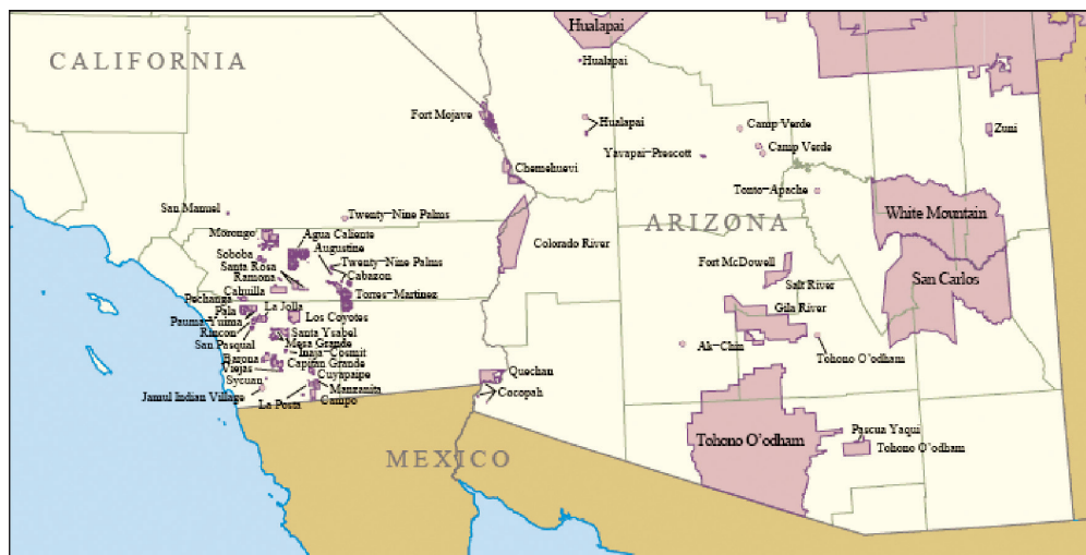
Tohono O’odham reservation is shown in southern Arizona.

transformed into an area bristling with weapons, new roads, spotlights and military surveillance vehicles. Beginning in the 1990s, a series of strategic decisions were made by federal agencies to clamp down on illegal entry at popular border crossing points—beginning in San Diego, California, with “Operation Gatekeeper” (1994), later spreading eastward with “Operation Safeguard” (1995) in central Arizona, and then “Operation Rio Grande” in the southernmost tip of Texas in 1998. 4 Various reasons have been suggested for these successive waves of intense border security—to displace drug and human-trafficking from densely populated areas to less visible locations and to change behavior of would-be crossers by re-channeling activity to areas with highly inhospitable conditions. The resulting “funnel effect” relocated vast amounts of illegal border-crossing activity to the Tohono