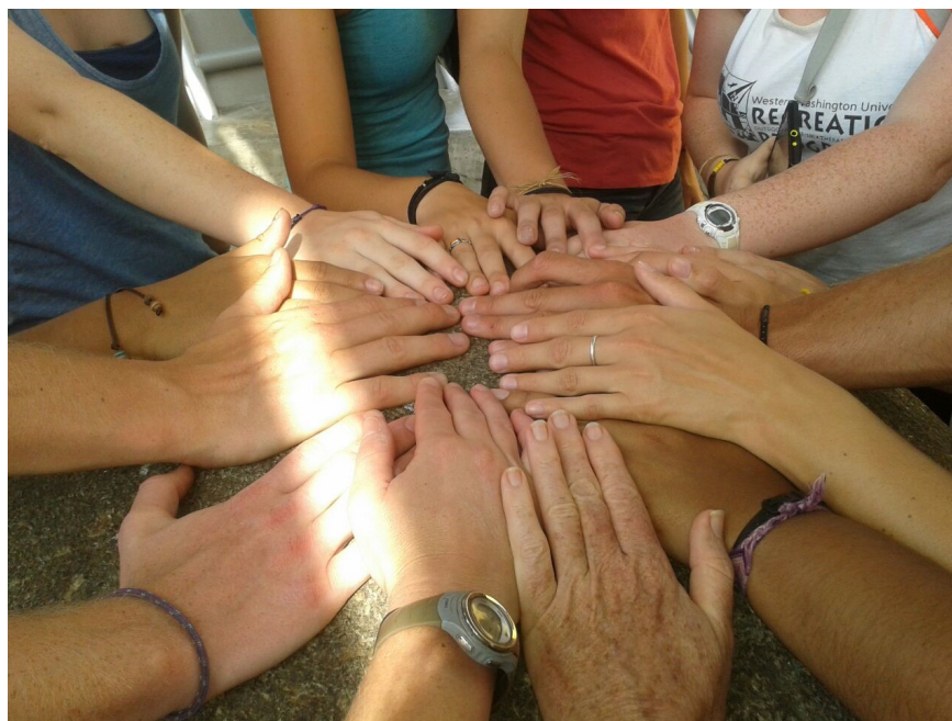
Figure 3: Communitas (Travelers in Costa Rica)

The third phase of the quest pattern is the journey itself (Campbell, 1968). Travellers step out of their door, metaphorically crossing the threshold from ordinary to extraordinary, and depart for experiences and places unknown. They leave the safety, predictability, and routine of daily life and journey into the mystery with hopes of having the sacred revealed to them (see Figure 3).