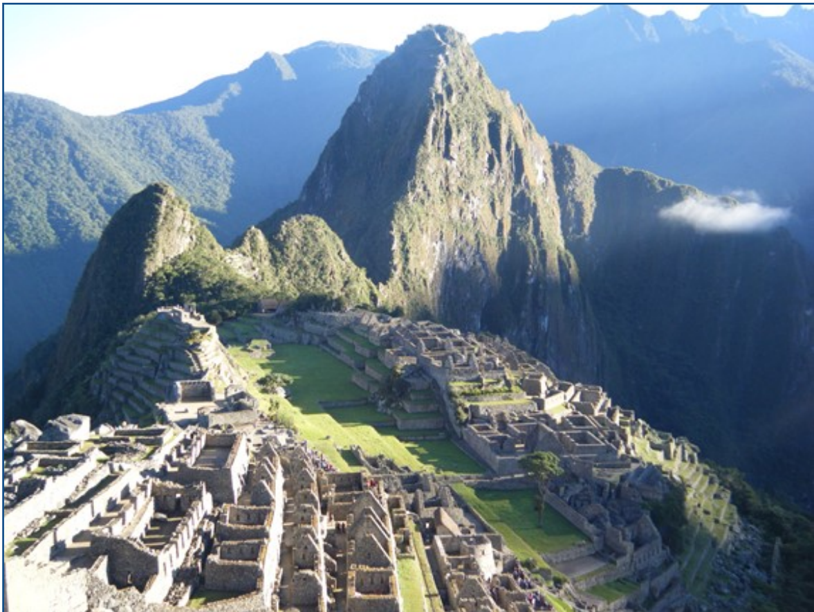
Figure 2 : Commitment and Ritual (Machu Picchu, Peru at the end of a 5-day journey along the Inca Trail)