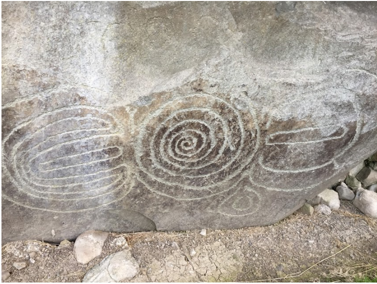
Figure 1: Mystery and Contamination (Newgrange, Ireland)