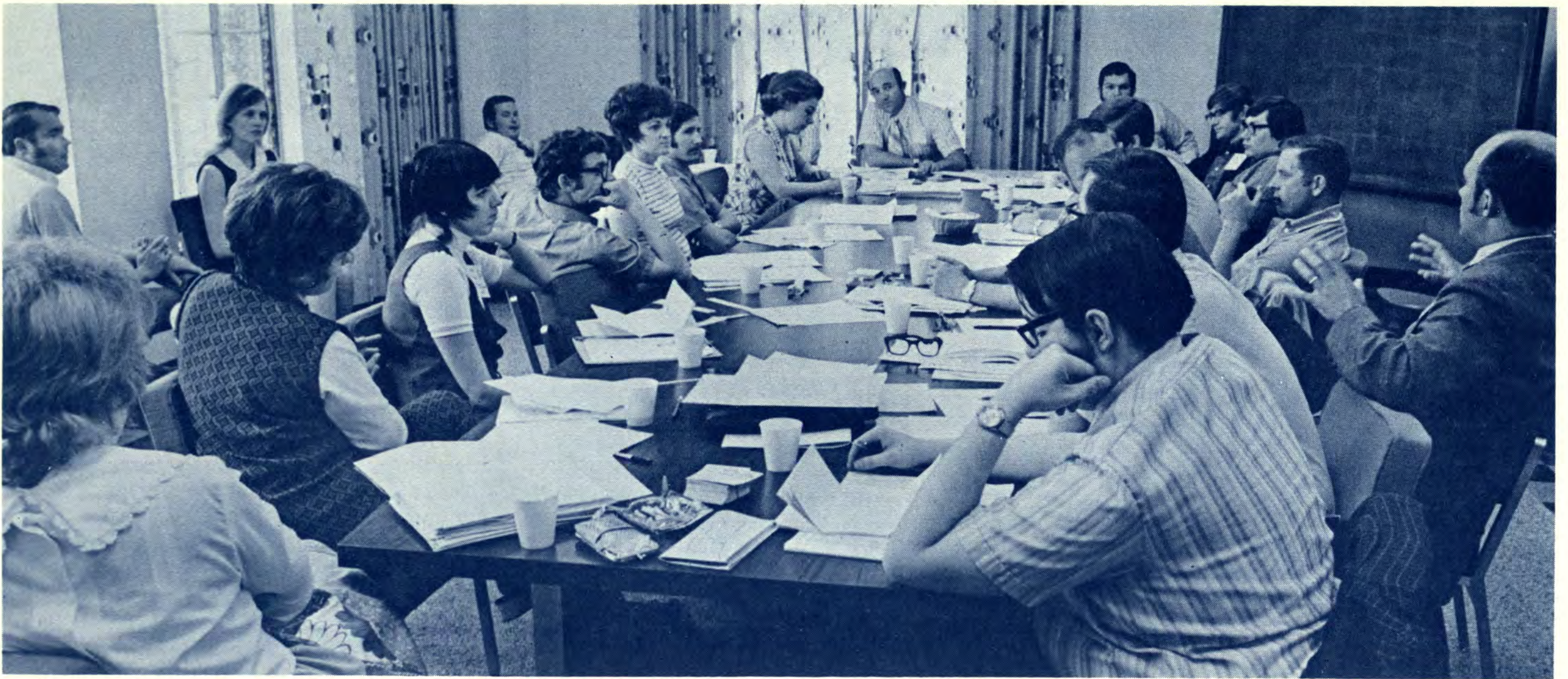
Alumni Board in session