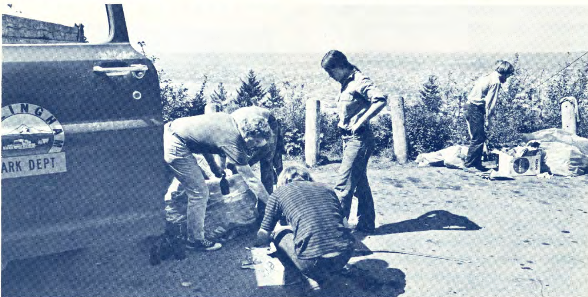
SEHOME CLEANUP—WWSC students spent an afternoon during spring quarter cleaning up bottles and other trash from parking areas, roadways and wooded sections on the top of Sehome Hill. A dump truck and driver were donated for the cleanup by the Bellingham Park Department. Plastic bags for depositing trash were donated by Bell Rainier Distributors. The event was organized by the college arboretum committee, which hopes to eventually turn the hill into a joint city-college arboretum park.

"Of course, I think the world would be a fine place if everyone believed as I do," he says. "We need drastic changes in the way man views his natural surroundings; however, I realize it's unrealistic to expect people to change their attitudes overnight."