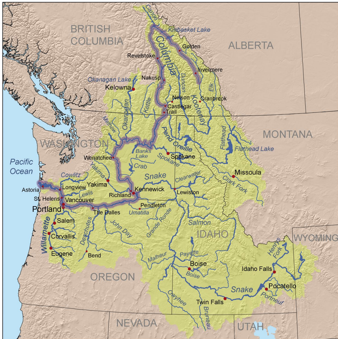
Figure 1: Map of the Columbia River Basin, including Columbia River and principal tributaries, which drain portions of seven western US States and the Canadian province of British Columbia. The main stem of the Columbia River is highlighted.