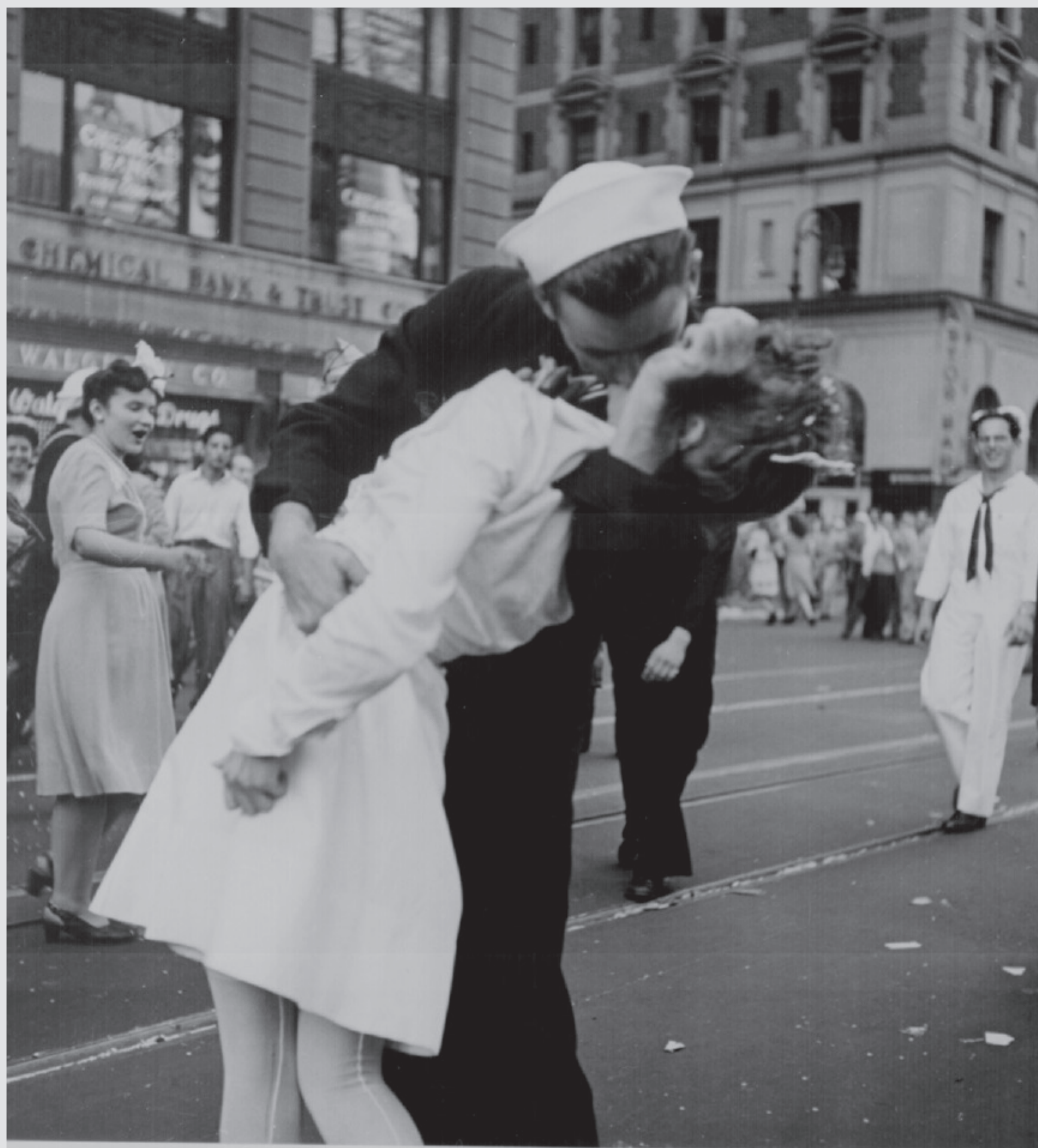
Figure 1, Victor Jorgensen, National Archives "Victory and Peace." World War II Records. (n.d.) National Archives. Retrieved from https://www.archives.gov/research/military/ww2/photos .

The iconic image V-J Day in Times Square is nationally remembered for the celebration of the end of World War II. Focusing on the archival collection Victory and Peace from the National Archives, this research demonstrates a disconnect in American perceptions and the reality of culture through iconic images. Specifically I investigate the extent to which images from the 1940s romanticized, celebrated and replicated in reflection of remembrance of the World War II era. These replications do not properly reflect the true events in 1945, but rather the idea that many would like to take away from this era. The images I refer to throughout this research regarding a sudden kiss contributes to this generation's nostalgia that comes from World War II phenomena. The relevance that this paper has to this contemporary moment contributes to the ideas of sexism, dominant American culture and the freedom of expression.