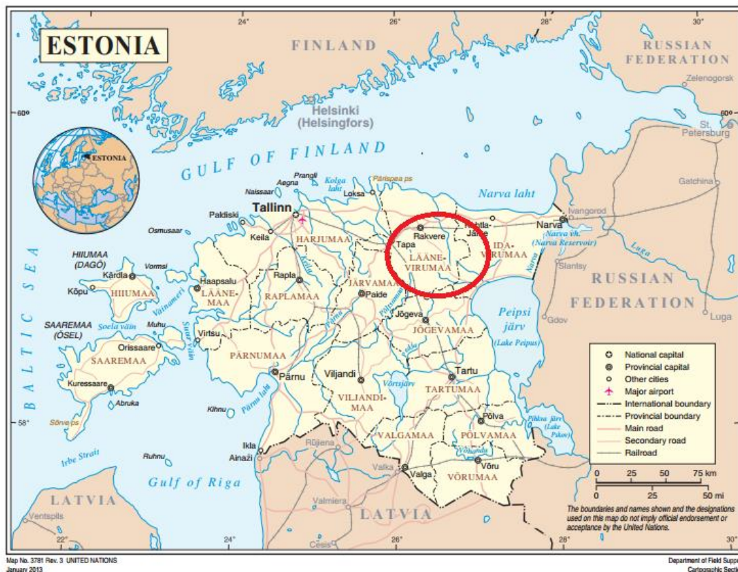
Figure 2. Map of Estonia

Original map credited to the United Nations (2013). Red ellipse added for emphasis of Rakvere-area mining-affected region.