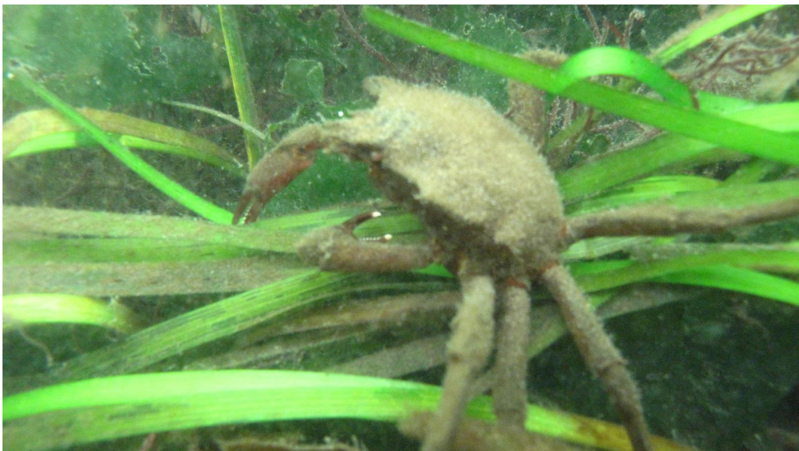
Photo 1. Photo of kelp crab utilizing eelgrass on at the study site.

A resampling method was used to compare means between the pipe and reference locations at the shallow, mid, and deep sites. This method shuffled the count values at a given depth band and redistributed the values into two new groups; the difference between means of these resampled groups was then calculated 1000 times. A p-value was calculated by taking the number of times the absolute difference of the means in the resampled data was greater than the absolute difference of the means and dividing that by the number of times shuffled (1000). The p-values for this test indicate how likely it is by random chance that the difference of the means between the two sites would differ from what was observed during this survey. It does not represent the ability to reject or not reject the null hypothesis.