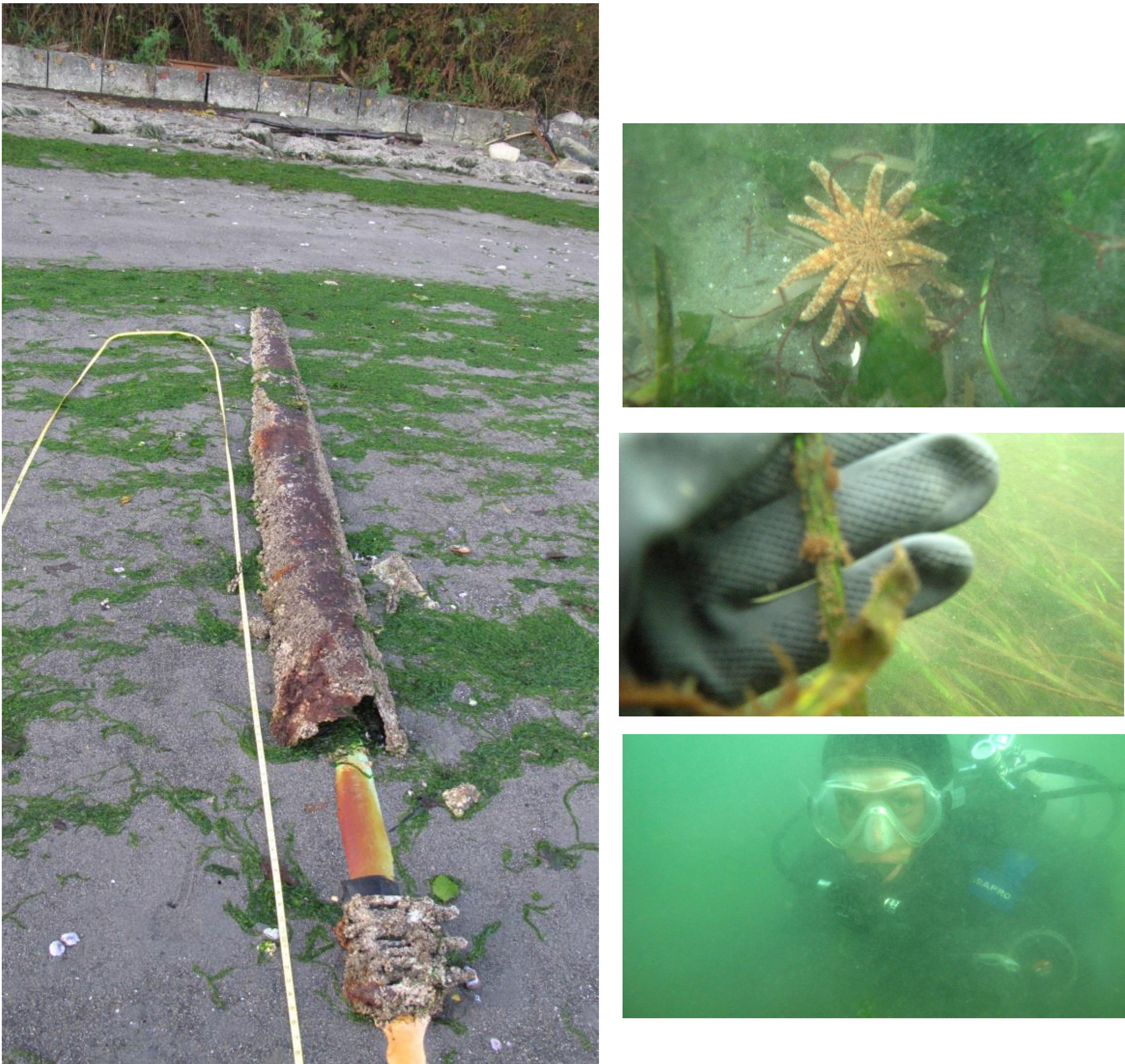
Photos (Clockwise). 1. Photo of exposed pipe high in the intertidal zone. 2. Sunstar. 3. Epiphytes on eelgrass. 4. Diver at the study site.

One possible alternative to standard parametric statistics with data that is highly variable would be to use non-parametric statistics. Non-parametric statistics do not require a normal distribution of input data. The resampling method used as an alternative in the study was simple to employ and results are easier to understand by non-scientists. In this study MatLab was used to perform analysis, but there is also versions of this in R, as well as an add-in for Excel.