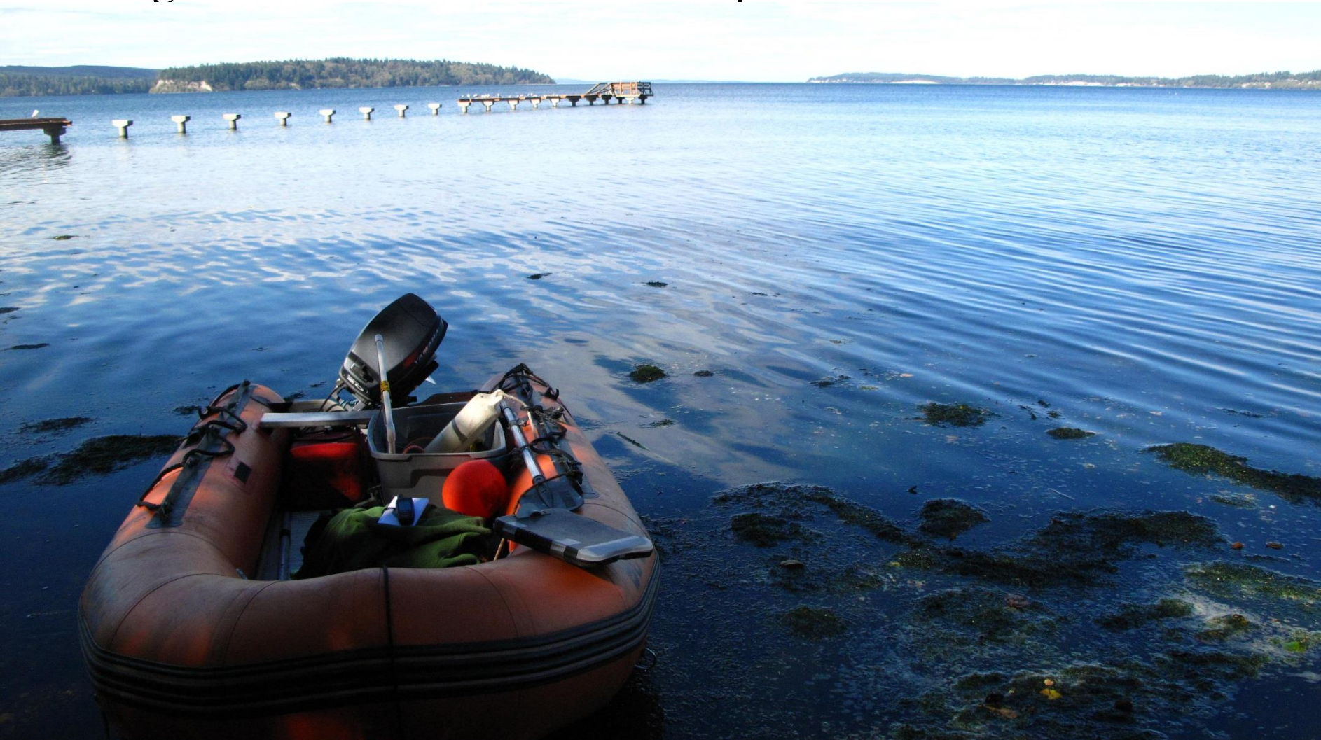
Photo 1. Photo of study site.