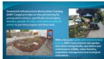
Outreach & Community Engagement