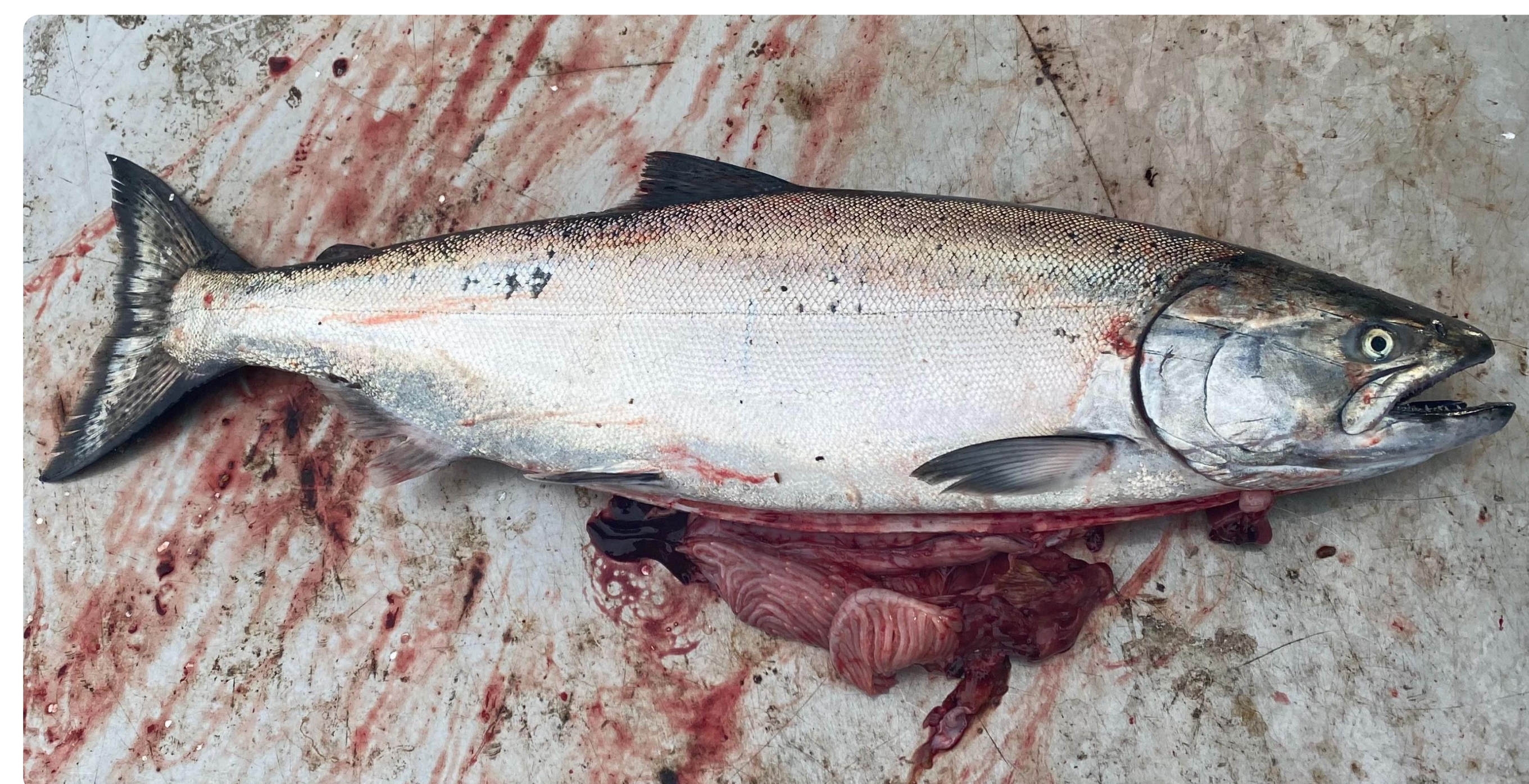
Chinook Salmon ( Oncorhynchus tshawytscha )

Herring > 50% in all regions Northern Strait of Georgia 15% myctophid Western Strait of Georgia 82% Herring Howe Sound 16% anchovy, 15% surfperch Sooke 20% mysid shrimp