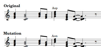
Figure 5. Comparison between original musical sequence and D572N musical sequence. The chord representing the mutated amino acid is labeled with the corresponding amino acid.