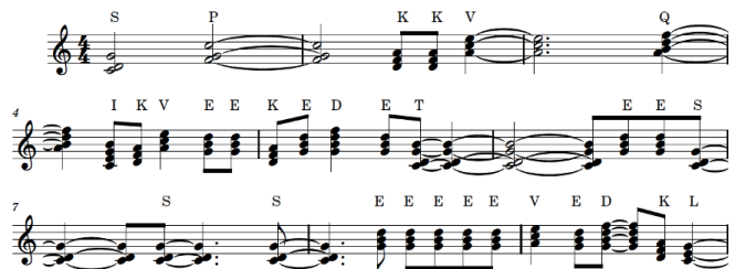
Figure 3. Comparison between first and second arrangements. Arrangement 1 assigns chords based on amino acid sequence but does not account for rhythm. Arrangement 2 utilizes the same note assignments, but also dictates rhythm based on codon frequencies.

Finally, in order to produce a realistic musical composition, dynamics had to be introduced. Membrane topology served as the basis for dynamics assignment. As a transmembrane protein, TMC1 alternates between three domains: cytoplasmic, transmembrane, and extracellular. Cytoplasmic domains were assigned a forte dynamic (loud), transmembrane domains were assigned a mezzo forte dynamic (moderately loud), and extracellular domains were