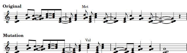
Figure 4. Comparison between original musical sequence and M654V musical sequence. Musical translation as in Figure 2. The chord representing the mutated residue is labeled with the corresponding three letter abbreviation.

Even seemingly innocuous mutations such as an acidic residue to its related amide are injurious. D572N is an autosomal dominant mutation that causes progressive hearing loss (DFNA36). This mutation of Aspartic Acid to Asparagine results from a DNA mutation at the 1714 th nucleotide, changing a GAC codon to an AAC codon. Because these amino acids are similar in structure, the differences in their chord structures are minimal, varying by the removal of a single note. Aspartic Acid is represented by a G dominant 7 th (G7) chord (G-B-D-F), whereas Asparagine is represented by a B diminished (Bdim) chord (B-D-F). Additionally, the GAC and AAC codons occur with a similar frequency (17.08 and 22.34,