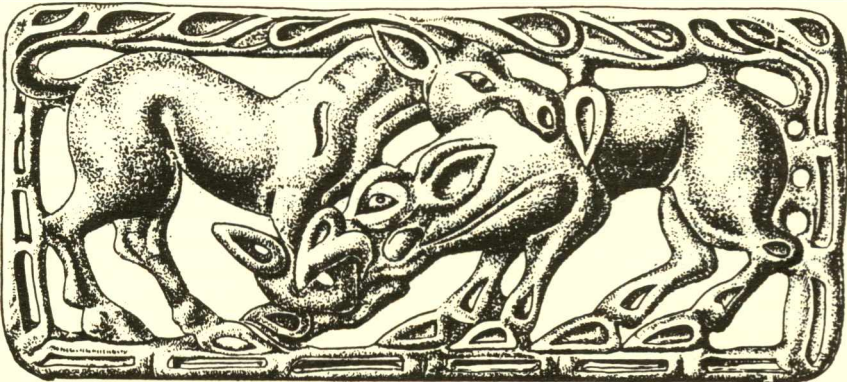
Bronze Plaque From the Ordos (entry 1439)