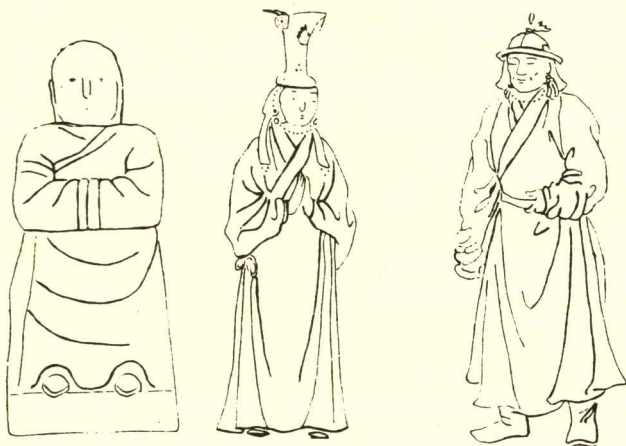
Ancient Mongolian Costumes (entry 0434)

See also entries 0218 0806 0820 0821 0997 1106 1107 1372 1373