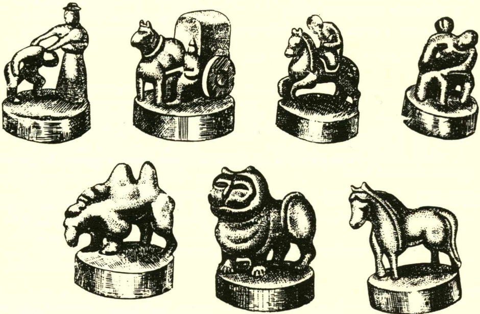
Mongolian Chess Pieces (entry 1439)