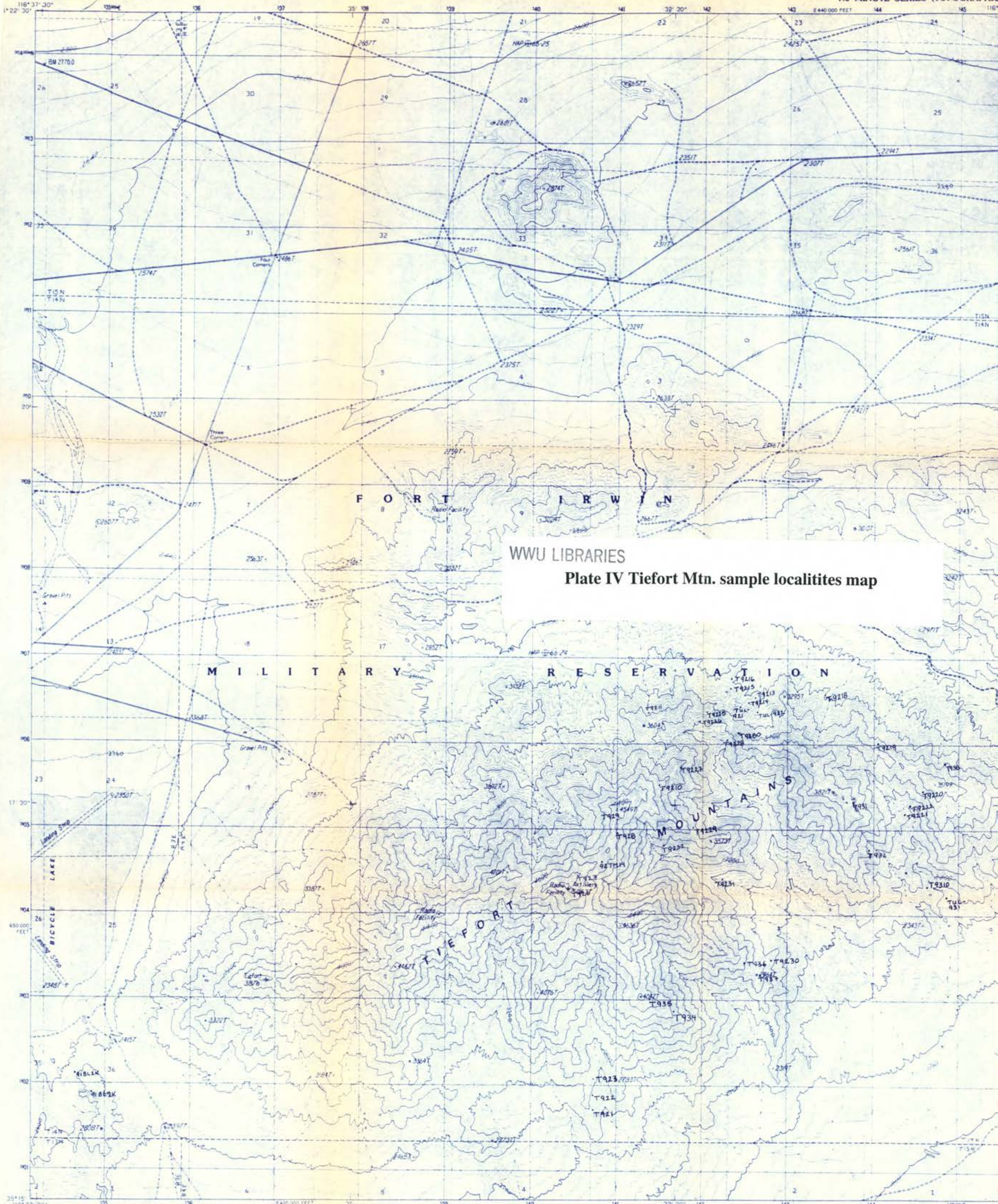
WWU LIBRARIES Plate IV Tiefert Mtn. sample localities map

PRODUCED BY THE UNITED STATES GEOLOGICAL SURVEY CONTROL BY USGS, WASHINGTON COMPILED FROM AERIAL PHOTOGRAPHS TAKEN 1983 FIELD CHECKED 1984 MAP EDITED 1986 PROJECTION LAMBERT CONFORMAL CONIC GRID 1000-METER UNIVERSAL TRANSVERSE MERCATOR ZONE 11 10000-FOOT STATE GRID TICKS CALIFORNIA ZONE 5 UTM GRID DECLINATION 015 EAST 1983 MAGNETIC NORTH DECLINATION 1430 EAST VERTICAL DATUM NATIONAL GEODETIC VERTICAL DATUM OF 1988 HORIZONTAL DATUM 1983 NORTH AMERICAN DATUM To place on the predicted North American Datum of 1983, move the projection lines as shown by dashed corner ticks (4 meters north 80 meters east) There may be private inholdings within the boundaries of any Federal and State Reservations shown on this map Where omitted, land lines have not been established No distinction made between houses, barns, and other buildings