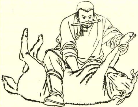
Slaughtering a Sheep (entry 1223)

See also entries 0076 0077 0084 0085 0086 0222 0449 1169 1170 2161 2169