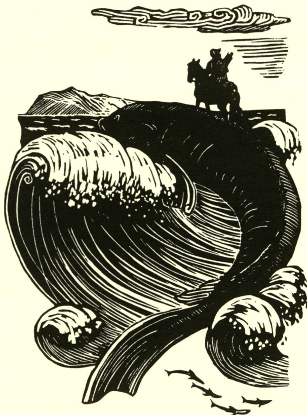
Illustration from entry 2420

For works written in Oirat, see entries 1557 1680 2468 2470 2488 2489 2598 2739 2775 2831 2875 2947 2952 3143