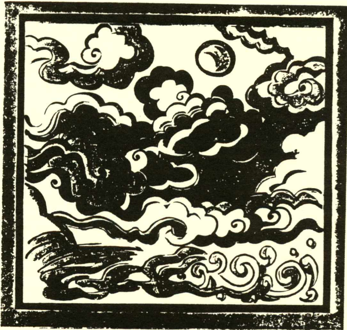
Illustration from entry 2363

See also entries 0021 0575 0578 0586 0588 0589 0590 0593 0594 0595 0596 0605 2189 2231 2244 2245 2246 2248 2249