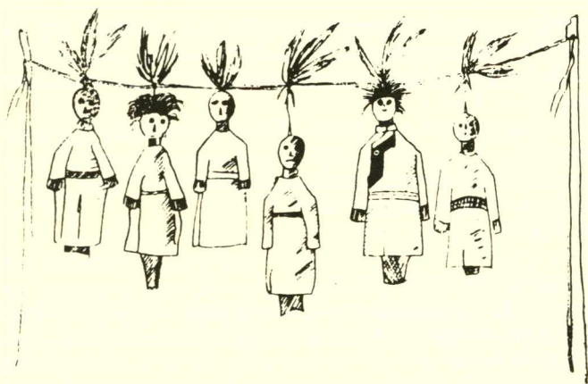
Darkhad Ongots (entry 1188)