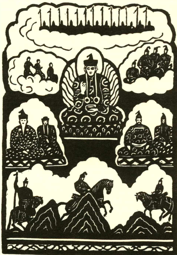
Illustration from entry 2434