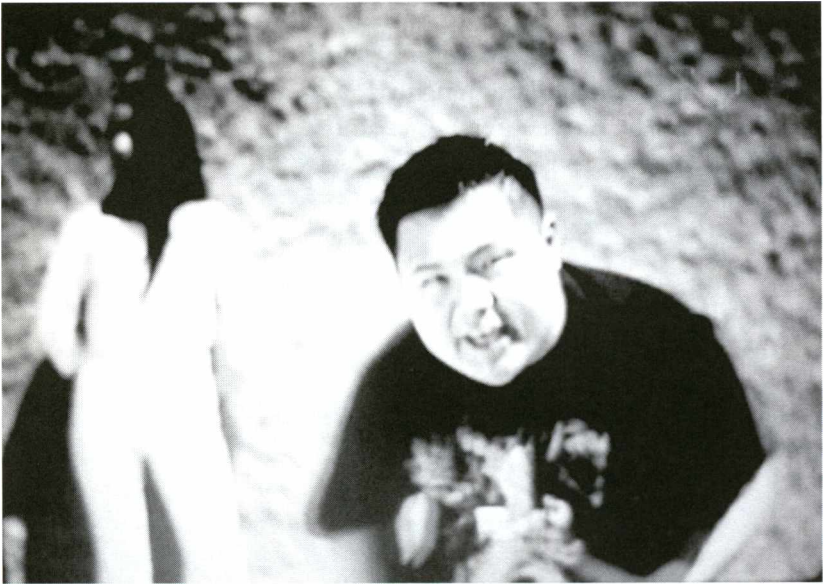
The group Lumino, from the video “Khüniikh” (Lumino 2003).

A song by the group Digital, “Only One Life to Live” ( Gants l amidarch ükhne ), has the rappers struggling with deeper questions about how one should live one’s life: