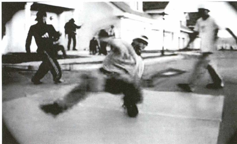
Breakdancing on the street, from the video “Jin tan” (Snep Crew 2004).

breakdance. The overall image is of a community filled with young people living in one close-knit “neighborhood,” all having a good time through dancing, listening to and making music, playing