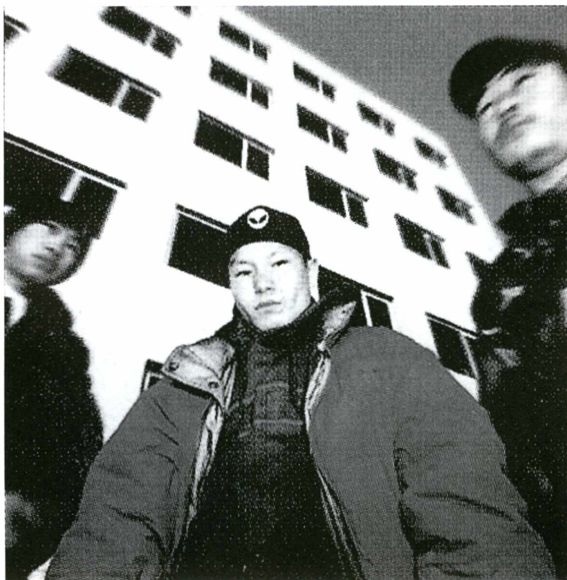
The group Tatar (Tatar n.d.).

techno, and house beats. The group's attempts in the late 1990s to establish a nationalist-oriented nationwide youth organization shows that their "play" with these Western cultural forms was also an engagement with the very serious business of cultural politics in the nation in that period. Many hip-hop artists today do not consider Black Rose to be a part of the early history of rap in Mongolia, labeling their style as "techno." But in its popular mixture of music, dance, and performance art, as well as its cultural outspokenness, the group clearly did help a rising generation of Mongolian performers to conceive of popular music in new ways.