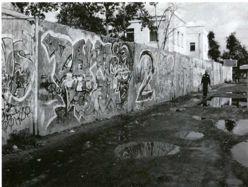
Graffiti images associated with hip-hop groups in downtown Ulaanbaatar.

Graffiti has also emerged as another form of insubordination broadly associated with hip-hop in Mongolia. While many instan-