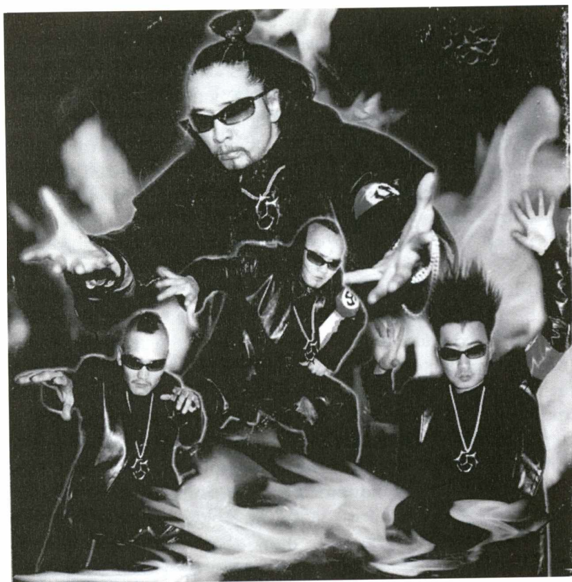
The “techno-rap” group Black Rose (Black Rose 2001).

the Mongolian pop song conventions of the day, the group was seeking to clear a space for a new subcultural musical style. Although influenced by the Western “techno” and “rap” artists they had experienced through the media, they sought to create and market a new musical voice that they felt to be particularly well suited to the cultural and political landscape of their homeland.