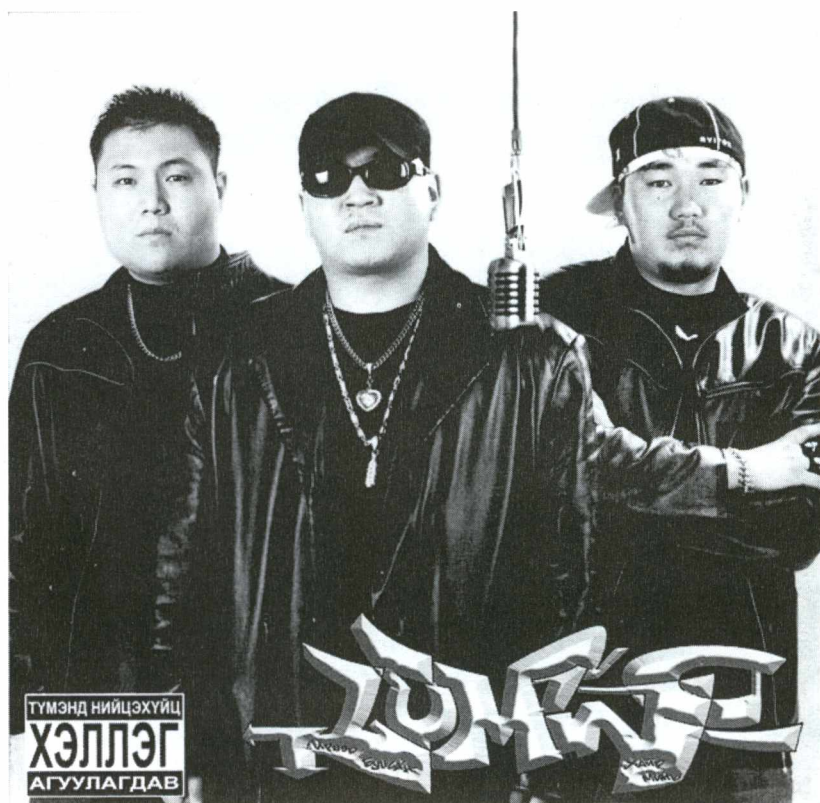
The group Lumino in hip-hop style (Lumino 2003).

wear (usually bearing the icons of American sports teams) to tight-fitting leather jackets and pants. Many wear large pieces of jewelry, such as rings and chain necklaces, and commonly bare body piercings and tattoos. Most wear baseball caps (worn backward or to the side), but some shave off their hair completely. The rappers bounce and sway to the beats of their music on stage and in their videos, and typically use hand signals and gestures seen in Western rap videos. In each of these ways, Mongolian rappers are both aligning themselves with international hip-hop customs while also