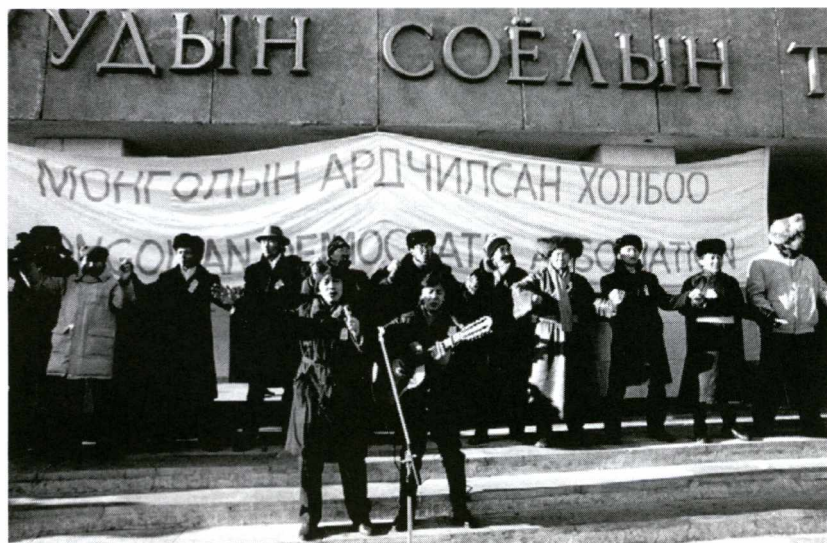
The group Khonkh performing during one of the pre-democracy protest rallies in 1990.

The band Bell ( Khonkh ) also played an important role in this regard. It was led by two young Mongolian classmates who had just returned from journalism school in Russia. The group's most famous song, "Sound of the Bell" ( Khonkhny duu ), calls on people to wake up to the dawning of a new day. Its melody was taken up and sung by protesters during the street demonstrations and protest rallies that took place outside government buildings between 1989 and 1990.