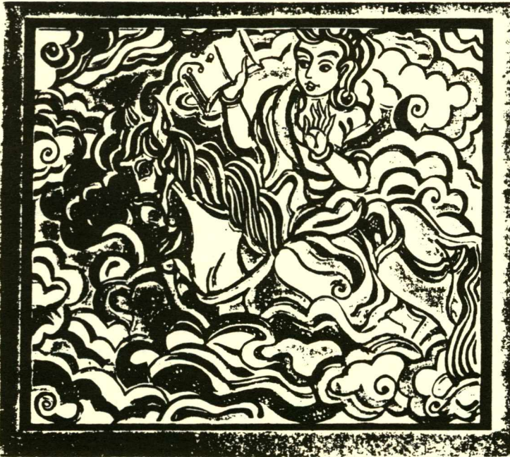
Illustration from entry 2363