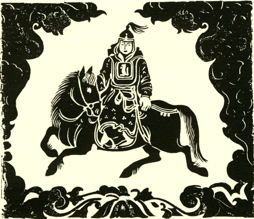
Illustration from entry 2388