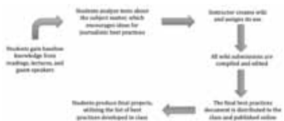
Figure 4. Model for wiki use in a non-journalism classroom

The wiki projects outlined here are applicable to non-journalistic academic settings. Figure 4 illustrates the primary steps involved in implementing a wiki project in a non-journalism classroom.