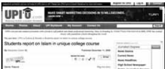
Figure 2. A screen shot of an article on the course “Reporting on Islam” published on the wire service.

Taken together, the comments reveal that the course was meaningful for him: It “definitely made me uncomfortable at times, but honestly, that is how I know it was worthwhile ... It helped me experience a part of the world and this country that I never had before.”