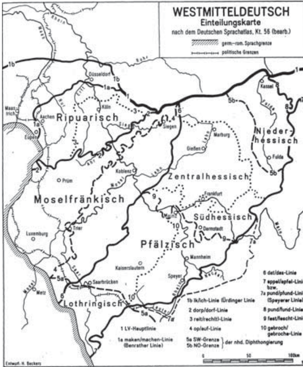
Figure 2. West Central German dialect area (Beckers 1980:469).