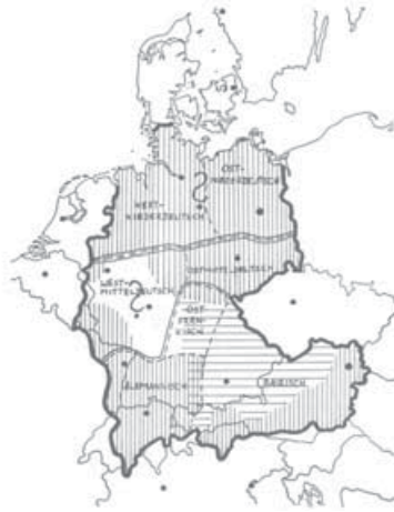
Figure 1. Empirical gap in the distribution of the 2-3 vs. 3-2 order, modal IPP construction (Patocka 1997:265).

data for the West Central German (WCG) dialects remain lacking. 3 This state of affairs is reflected in the graphic from Patocka 1997:265 (see figure 1), which shows the distribution of the 2-3 vs. 3-2 order in what is known as the modal IPP construction. 4